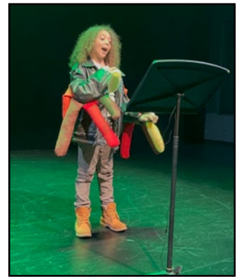
Atif took on the form of Turgock , a scientist turkey.