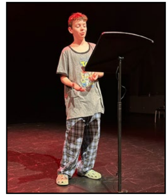
Milo played Zeke , a teen-age hunter.