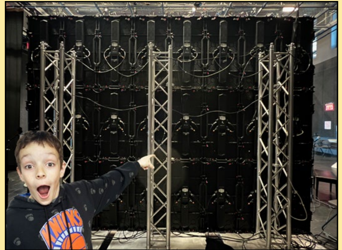
The backstage view: lots and lots of cables!

Those of you who have seen Stanley Kubrick's 1968 film 2001: A Space Odyssey know the excitement that a black monolith can inspire in a bunch of primates. Well, one such slab arrived at The Five Angels Theater early this year and created quite a stir. We're talking about the brand-new video LED wall that has replaced our old rear projector and screen. Purchased with a generous grant from the New York State Council for the Arts , The Wall , as we call it, is nearly 20% larger than the old screen but, more importantly, many, many times brighter. Backgrounds and fancy visual effects are dramatically more visible, no matter how much stagelight washes over the stage. Further bonuses include a larger playing area, since we no longer need precious space to "throw" a projection from behind, and performers and crew can cross backstage without fear of treading on the Trapezoid of Terror and casting a shadow on the screen.