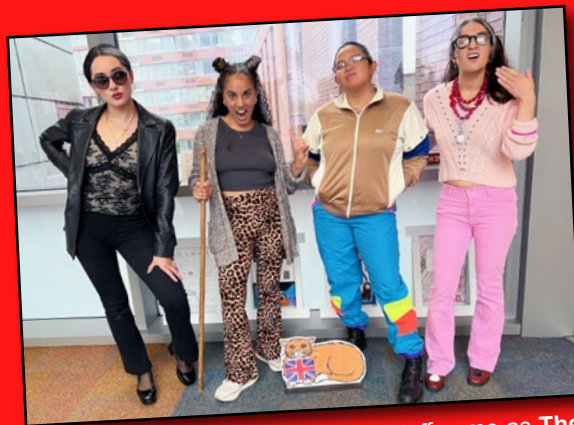
Halloween Party: one-third of the staff came as The Spice Girls as senior citizens.