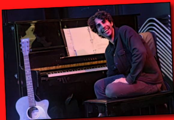
A Breath of Fresh Air: Composer Fouad Dakwar is always happy.