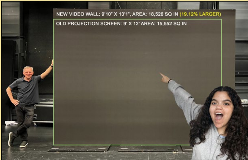
The new video wall as seen from the audience.