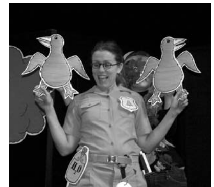
Fran McDormand as Ranger Sophia.