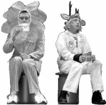
Nate Corddry as a flower/male model and Edie Falco as a deer/mechanic (see page 1).