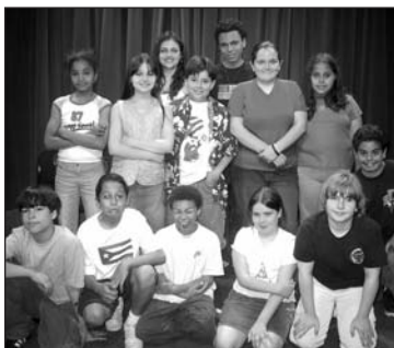
The kid playwrights of Replay , '04.