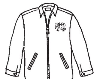
The Car Coat

The jackets feature a large embroidered version of the Project's Shel Silverstein logo in green and red on the back. We think that the denim jacket will cost around $85 and the car coat will be $150, but we'll have more information later on. We need a minimum of 12 in either style to place the order, so the more, the better. GB