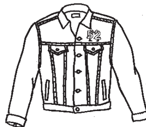
The Blue Denim