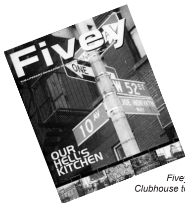
Fivey is out! Stop by the Clubhouse to pick up your copy.

PRESORTED FIRST CLASS MAIL U.S. POSTAGE PAID PERMIT #4292