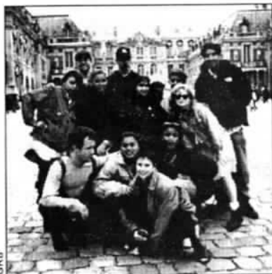
GRB The Twelfth Night company (most of them, anyway) at Versailles.