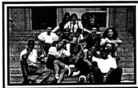
..... Graham- Windham .....