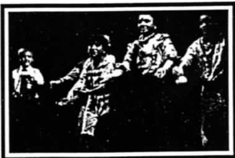
..... The Kids Take A Bow At Lincoln Center .....