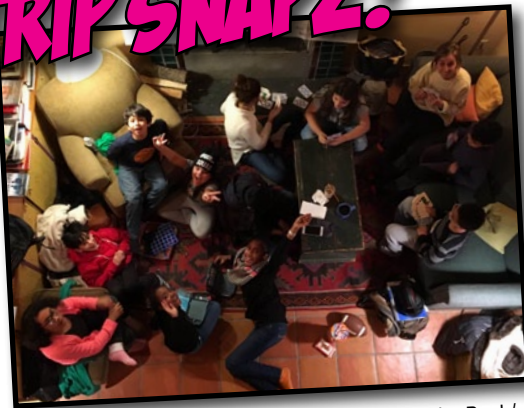
Stone Ridge: Seen from an overhead bridge in the Bash/Gorn house, the Playmakers take a break.