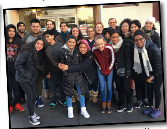
Bowling at New City Lanes: We were so pleased with our skills that we all played a record three games.