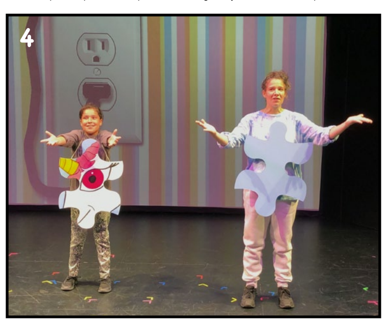
GOOD VIBRATIONS